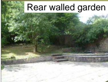
Rear walled garden